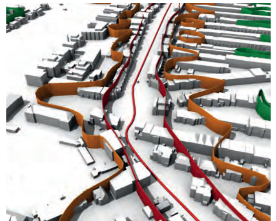
▲ Figure 2, Noise pollution by a tram line simulated with Geomilieu-DGMR on data from City of the Hague and visualised in Blender; the red, orange and green contours represent high, medium and low noise pollution, respectively.

community, including researchers as well as practitioners within local governments and companies. However, software adaptation is lagging behind – and CityGML is no exception, since familiarisation of a new standard in a community always follows a steep curve.